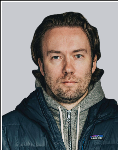
David Heinemeier Hansson 46 Oregon, United States Director since 2024 Independent

David Heinemeier Hansson has been a member of our Board since November 2024. He is the Co-Owner and Chief Technology Officer of 37signals, the company behind Basecamp, HEY, and ONCE. He is also the creator of Ruby on Rails, a pioneering open-source web application framework that he continues to develop today. As a best-selling author, Mr. Heinemeier Hansson has co-written several notable books, including "REWORK," "It Doesn't Have to Be Crazy at Work," "REMOTE: Office Not Required," and "Getting Real," alongside Jason Fried. He is also a regular contributor to Hey World and frequently shares his expertise on various podcasts. Mr. Heinemeier Hansson earned a degree in Computer Science and Business Administration from Copenhagen Business School.